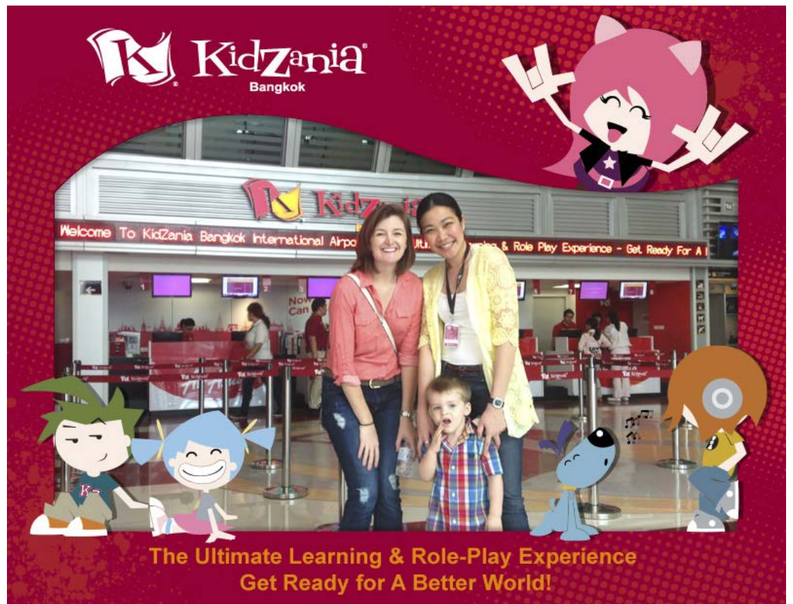
Kidzania - Postcard