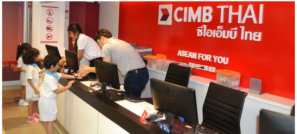
Kidzania - Bank

an airport ticket check in desk, which happens to be sponsored by Air Asia. Once you have purchased your tickets, the ticket counter representative will hand you a map, a check which your child will have to take to the bank once inside, and a wrist band. As a parent, the wristband was a very reassuring feature. Both the child and the parent have a wristband that work together, this way one can't exit the premises without the other and if anyone happens to get lost the staff can track the location of the individual wearing the bracelet- safety first!