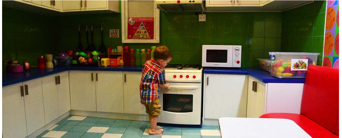
Kidzania - Kitchen